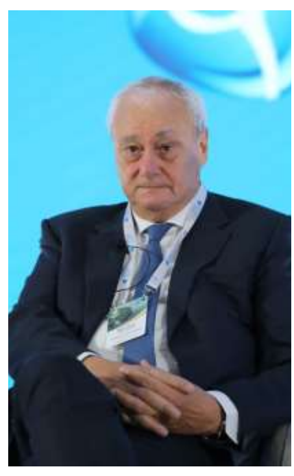
provided to Ukraine and its people.

2022 was marked by the aggression by the Russian Federation against Ukraine, one of the CEI Member States. Leading the CEI-ES was extremely challenging due to the ripple effects the aggression caused on the entire CEI region. Besides the immense loss of lives and the economic and humanitarian crises it provoked, various sectors such as the energy and food industry or healthcare were exposed to severe disruptions.