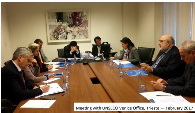
Meeting with UNESCO Venice Office, Trieste — February 2017

The representatives of the Adriatic - Ionian Initiative (AII), the Black Sea Economic Cooperation Organization (BSEC), the Central European Initiative (CEI), the Council of Baltic Sea States (CBSS), the Danube Commission, the Regional Cooperation Council (RCC) and the Union for the Mediterra-