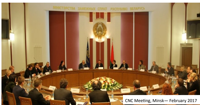
CNC Meeting, Minsk— February 2017

The CEI Committee of National Coordinators (CNC) met six times in 2017, with an exceptional participation of the Member States and their active role in the deliberations: three CNC meetings were held in Minsk (14 February, 22 June and 12 December), one in London (6 April), one in Trieste (16 May) and one in Salzburg (25 September). The CNC was involved, in particular, in the elaboration of the new CEI Plan of Action 2018-2020, as well as in the preparation of the high-level meetings. It also approved a number of projects and launched a number of ideas and proposals, tackled by the Secretariat throughout the year.