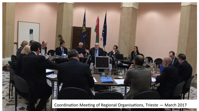
Coordination Meeting of Regional Organisations, Trieste — March 2017