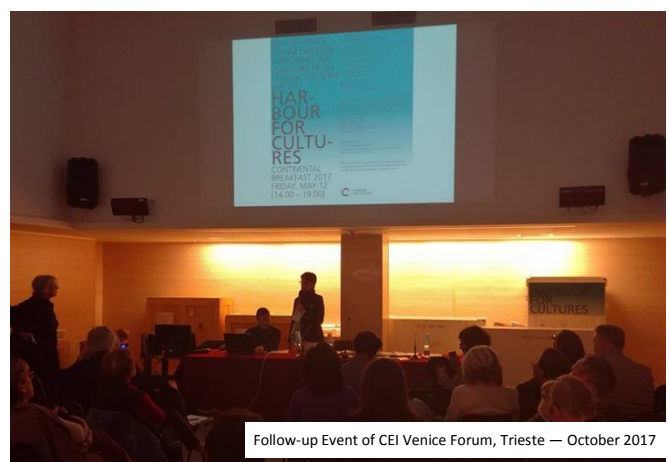
Follow-up Event of CEI Venice Forum, Trieste — October 2017