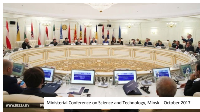
Ministerial Conference on Science and Technology, Minsk—October 2017

The Ministerial Conference under the title “Biotechnology for Healthy and Active Life in CEI Region” was held in Minsk on 26 October. The meeting gathered ministers of the CEI Member States, officials in charge of science, technology, innovations, healthcare, agriculture, and food industry. R&D centres and non-governmental organisations developing biopharmaceuticals and biotechnologies for agriculture were also invited to attend, along with the European Commission that presented the forthcoming Horizon 2020 Work