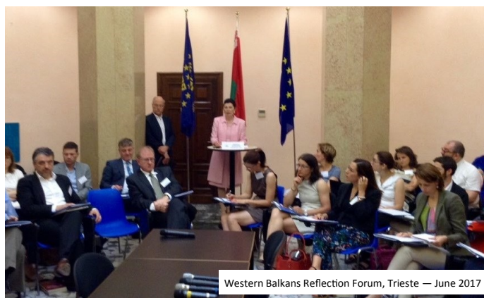
Western Balkans Reflection Forum, Trieste — June 2017

A Reflection Forum under the title “The Western Balkans in the European Union: Perspectives of a region in Europe?” took place in Trieste on 26-27 June, in the run-up of the Western Balkans Summit. The Forum gathered experts working in national and European administrations and institutions, researchers affiliated with European think-tanks and universities from 25 EU and Western Balkan countries. It represented a platform for exchanging opinions on the challenges the European enlargement policy is facing and the importance of regional cooperation. The first day was devoted to the academic roundtable “The Western Balkans in the European Union: Perspectives of a region in Europe?” held at the MIB Trieste School of Management, following by the official opening of the event. The main event was organised on the second day and took place at the premises of the CEI. The main topics covered by the discussions were: regional tensions and bilateral conflicts in the Western Balkans; Internal & regional security and investments in infrastructures & knowledge. The participants reaffirmed and emphasised the need for a stronger impact of the civil society on the EU enlargement process.