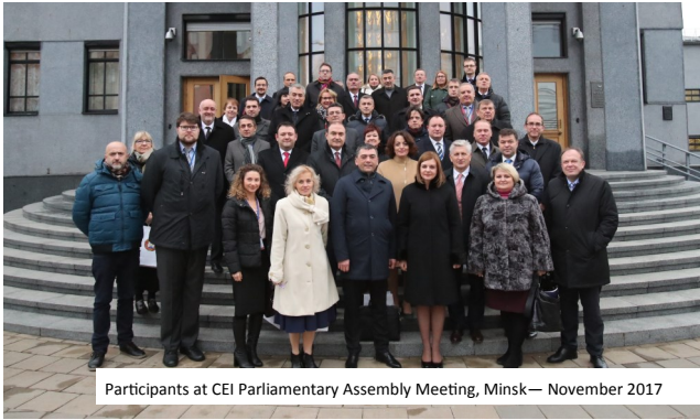
Participants at CEI Parliamentary Assembly Meeting, Minsk— November 2017