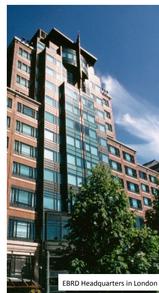
EBRD Headquarters in London

The Office is located at the CEI Headquarters in Trieste and in London within the Operational Policies Vice-Presidency of the EBRD. Through this Office - whose staff closely collaborates with EBRD banking teams - the CEI has managed to build a unique comparative advantage vis-à-vis other active funds within the Bank. This collaborative approach enables the CEI to better choose projects, thereby ensuring high-leverage ratios as well as greater effectiveness and efficiency. For the Technical Cooperation (TC) Programme, the Office for the CEI Fund regularly screens projects in the EBRD pipeline and supports the Italian Ministry of Foreign Affairs and International Cooperation, in its selection process. Following positive appraisal by the Ministry, the Office presents the prospective TC projects to the CNC for approval; it monitors their implementation and evaluates them after completion. The Office also manages the