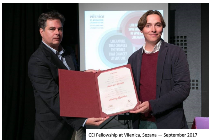
CEI Fellowship at Vilenica, Sezana — September 2017

The CEI has been presenting the CEI Fellowship for Writers in Residence in collaboration with the Slovene Writers' Association, as part of the Festival, since 2006. The Fellowship seeks to encourage cross-border cooperation and promo-