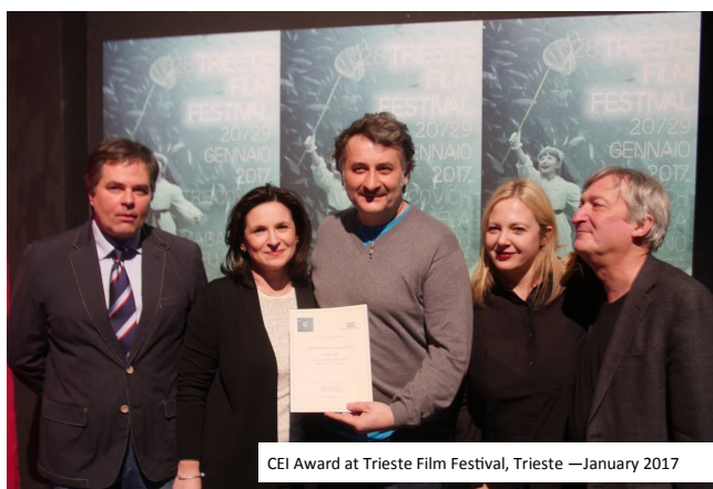
CEI Award at Trieste Film Festival, Trieste — January 2017

A follow-up event of the CEI Venice Forum for Contemporary Art Curators was held in Trieste on 28 October. Art curators, artists, architects and relevant experts gathered to resume the topics and present the "Harbour for Cultures H/C" project to the citizens of Trieste. The event, organised by Trieste Contemporanea Committee, was held at Magazzino delle Idee, in the framework of the exhibition Maria Theresa and Trieste . History and cultures of the city and its port and was preceded by a poetic walk through the Old Harbour of Trieste. In this context, the H/C project was launched and will be developed further within two years with an open process method, between art and urban topics, with the organisation of workshops and meetings, studies, exhibitions and multidisciplinary events. During the Trieste event, some of the most interesting visions, desires and perspectives collected so far were discussed and presented to the audience. Moreover, a first H/C exhibition was opened based on a spatial setting with a scaled representation of