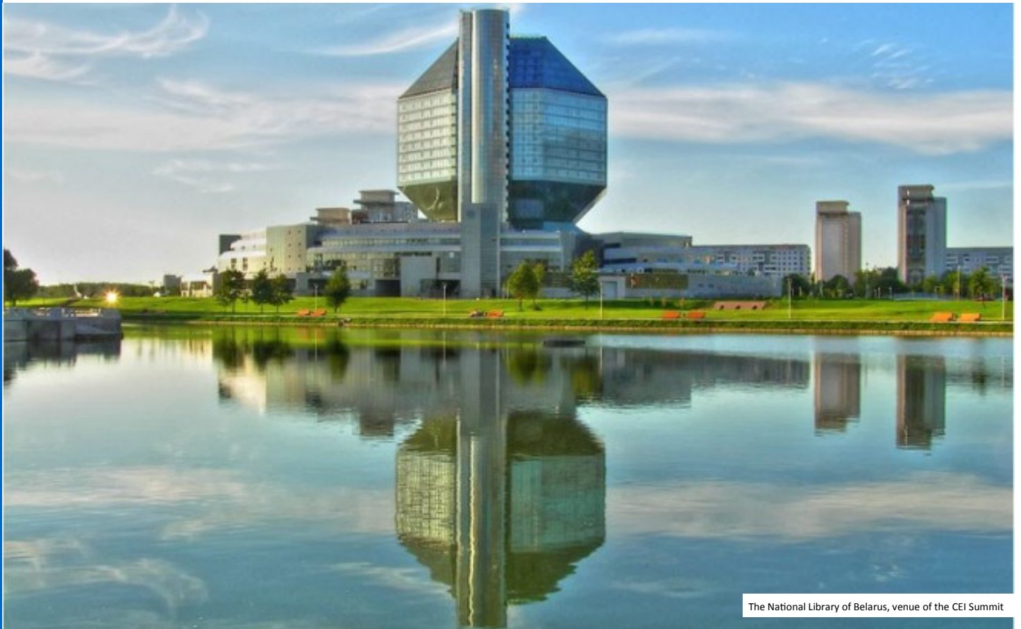
The National Library of Belarus, venue of the CEI Summit