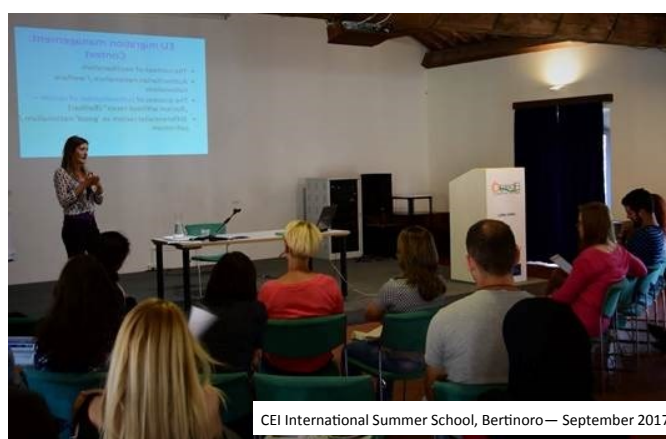
CEI International Summer School, Bertinoro — September 2017

The 23rd CEI International Summer School under the title “Envisioning Moving Frontiers: Migration Management, Minority Protection and the Enhancement of Territorial Cooperation” was held in Bertinoro (Italy) on 11-15 Septem-