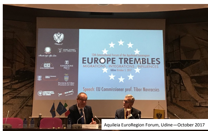
Aquileia EuroRegion Forum, Udine—October 2017

The XIII Central European Forum of Aquileia EuroRegion under the title “Migrations – Integrations – Revolutions” was organised by the Mitteleuropa Cultural Association, in cooperation with a consortium of public and private stakeholders in Udine on 5 October. The gathering witnessed the participation of prominent representatives of public institutions, diplomats, politicians and academics from the countries of Central and Eastern Europe and the Balkan area. Discussions focused on five thematic panels: European security issues; Italy and Friuli Venezia Giulia in the EU; Migrations, integrations and influences; Post Brexit Euro Economy; Perspectives from Central and Eastern Europe. The Forum was organised by the Mitteleuropa Cultural Association under the patronage of the Ministry of Foreign Affairs with the support of the Autonomous Region Friuli Venezia Giulia and the CEI.