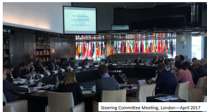
Steering Committee Meeting, London—April 2017

On 6 April, the Headquarters of the European Bank for Reconstruction and Development (EBRD) in London hosted the annual CEI Steering Committee (SC). The SC meeting was attended by the CEI National Coordinators and representatives from the CEI countries at the EBRD Board of Directors who discussed the recent developments in the CEI-EBRD cooperation. On that occasion, the 2016 Annual Report of the CEI Fund at the EBRD was presented and the Committee's members approved the 2016 budget of the Fund.