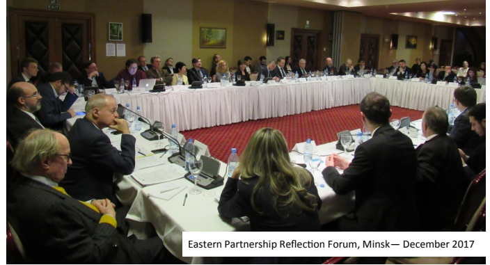
Eastern Partnership Reflection Forum, Minsk— December 2017

Member States, participants called upon all CEI Member States and their national parliaments to contribute to the creation of the necessary legal framework for enhancing data processing standards and the interaction of national regulatory authorities on digital market. They emphasised a need for further development of safe cross-border electronic services, electronic trading platforms, as well as closer cooperation with international financial institutions.