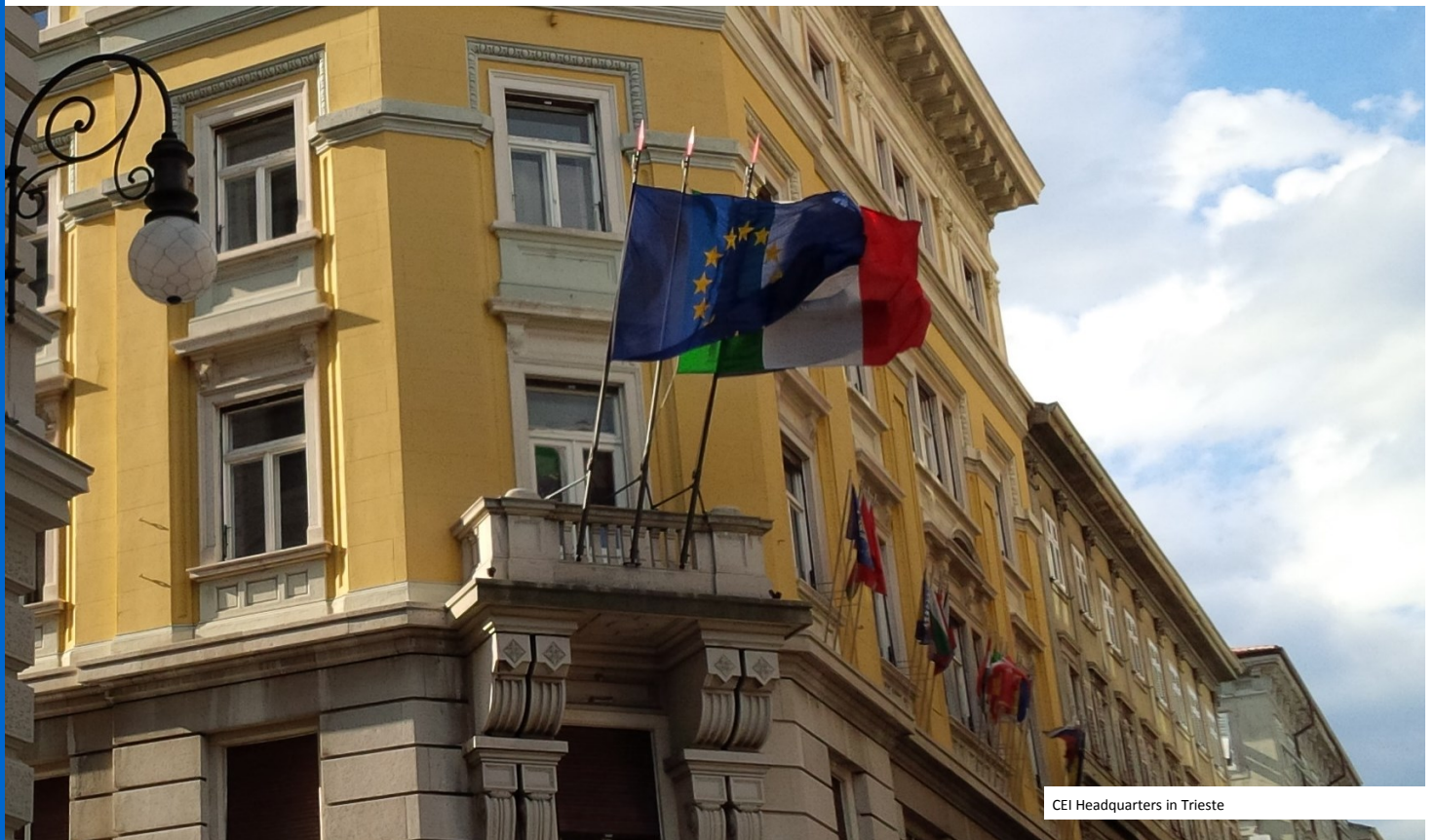
CEI Headquarters in Trieste