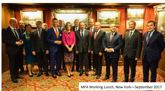
MFA Working Lunch, New York—September 2017

The Minister of Foreign Affairs of the Republic of Belarus, Vladimir Makei, hosted a Working lunch for his counterparts of the CEI Member States in New York on 21 September, on the margins of the UN General Assembly. The gathering was an opportunity for Ministers to discuss about performed activities during the current year and to point out the priorities for the upcoming period. They emphasised the efforts of the CEI in assisting the political and socio-economic ad-