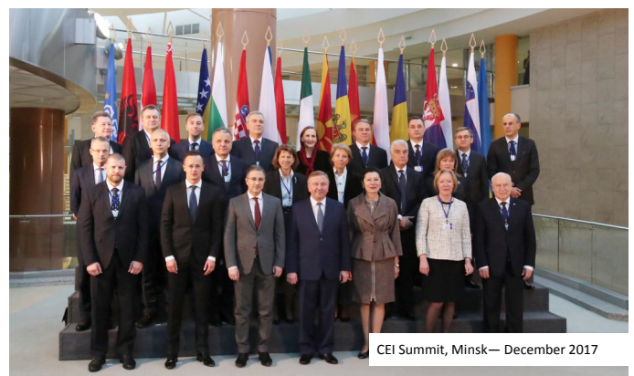
CEI Summit, Minsk— December 2017

The Meeting of the Heads of Government of the 18 CEI Member States (CEI Summit) was held in Minsk on 12 December. The Summit focused on the role of the CEI Member States in promoting connectivity and interoperability among various integration processes in a Wider Europe. The participants discussed main challenges facing the CEI regions such as transport and infrastructure interconnections, ongoing migration crisis and terrorism with special attention to countering cyber-terrorism. In particular, the delegations highlighted the importance of the development of transport