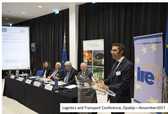
Logistics and Transport Conference, Opatija—November 2017

The expert conference on “Transport & Logistics - Optimization of the distribution of goods in the regions” took place in Opatija, Croatia on 9 November. The event was organised by the Institute of the Regions of Europe (IRE), in cooperation with the CEI, the Region of Primorje Gorski Kotar and the City of Opatija and the City of Rijeka. The conference aimed at exploring international trends and changes in modern logistics in three panel discussions: European challenges for cross-border transport and logistics chain in South-East Europe; Modern logistics solutions from the perspective of the transport industry; and The importance of intermodal termi-