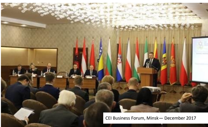
CEI Business Forum, Minsk— December 2017

Under the title “Energy Efficient and Ecological Technologies”, the CEI Business Forum took place in Minsk, on 4 December. About 200 representatives of state organisations, business community and academia from the CEI countries and international financial institutions (World Bank, EBRD) discussed the contribution of modern energy-efficient and environmentally-friendly technologies to achieve sustainable social and economic development in the CEI region. They exchanged views and experiences on different topics covering five thematic panel sessions: Energy Efficient Technologies, Economics and Finance, Science, Ecological Technologies, Energy Efficient Production and Products.