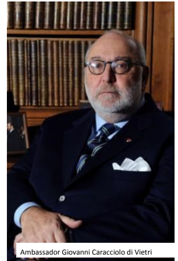
Ambassador Giovanni Caracciolo di Vietri

confident that this document will provide new dynamism and visibility to the organisation and will better align its capacities and activities with the fast-changing environment. Indeed, its adoption was accompanied by a number of measures proposed by the Heads of Government for its smooth implementation, which included: strengthening the