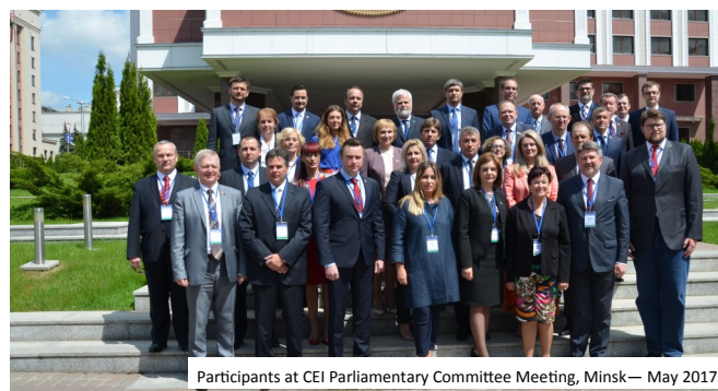
Participants at CEI Parliamentary Committee Meeting, Minsk— May 2017

The meeting of the CEI Parliamentary Committee under the title "Intellectualization of economy in the CEI region: innovative production, governance and human capital" was held in Minsk, on 29-31 May. The meeting was opened by Mikhail Myasnikov, the Chairman of the Council of the Republic of Belarus, who stressed the importance of joint beneficial cooperation among the CEI Member States in order to tackle challenges such as the fourth industrial revolution, ageing populations, and environmental security. In particular, he emphasised the role of the national parliaments