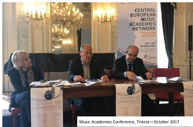
Music Academies Conference, Trieste—October 2017

The three-day event took place in Trieste on 16-18 October at the Music Conservatory “Giuseppe Tartini” and focused on the exchanges between representatives of institutions and music festivals of the Central European area, promoting active participation, and giving the possibility to lay the foundations of a system of cooperation among academic and professional institutes. The gathering’s main goal – among others – was setting music as a cornerstone in young people’s education and a key feature in the life of citizens of